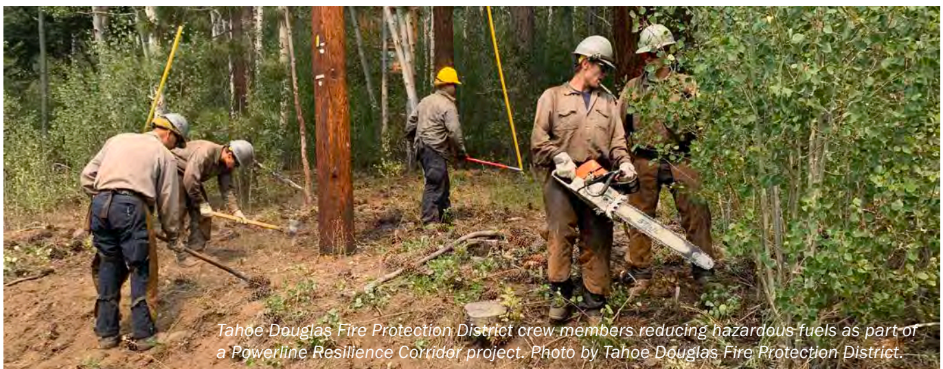
Tahoe Douglas Fire Protection District crew members reducing hazardous fuels as part of a Powerline Resilience Corridor project.

The California Tahoe Conservancy, with 2021 wildfire package and the California Department of Conservation's Regional Forest and Fire Capacity program funding, is providing grants to the Washoe Tribe, Lake Valley Fire Protection District, South Lake Tahoe Fire Rescue, and Tahoe RCD to build capacity to improve forest and wildfire resilience.