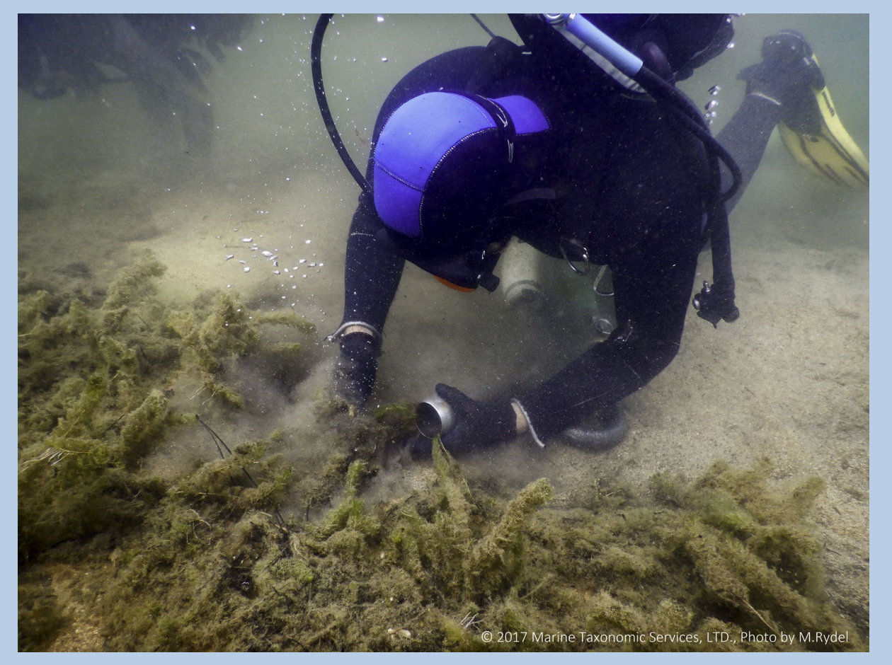
Marine Taxonomic Services