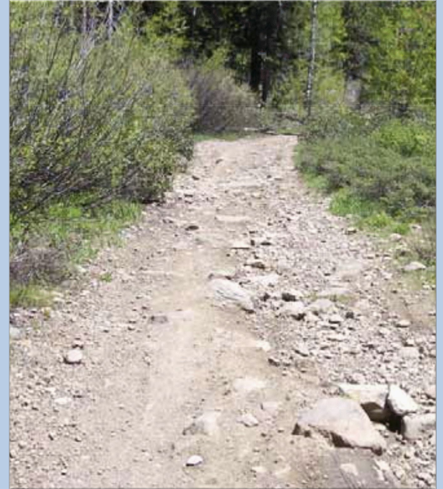
Gas Line Road