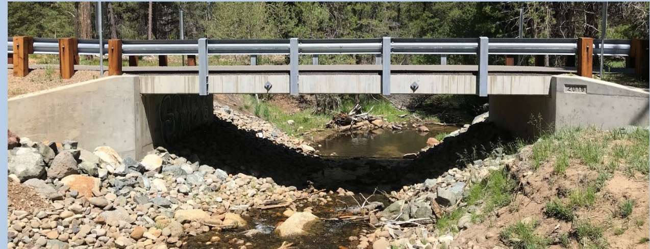
Example Bridge Design