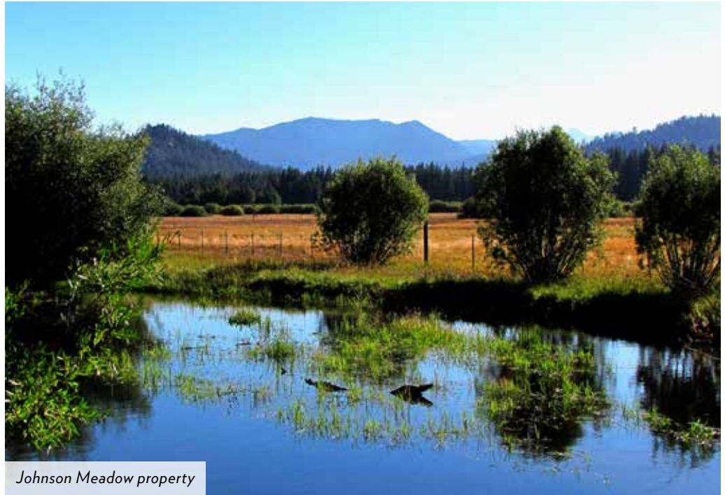
Johnson Meadow property

SECURED acquisition funding in partnership with the Tahoe Resource Conservation District to acquire Johnson Meadow, the largest privately-held stretch of the Upper Truckee River connecting over 1,000 acres of floodplain.