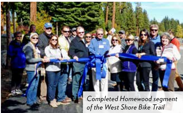
Completed Homewood segment of the West Shore Bike Trail

PARTNERED with the Washoe Tribe through a Memorandum of Understanding to increase coordination and encourage Washoe Tribe participation on Conservancy projects.