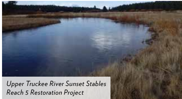
Upper Truckee River Sunset Stables Reach 5 Restoration Project

RESTORED 120 acres of stream environment zone in partnership with the U.S. Forest Service on the Upper Truckee River Sunset Stables Reach 5 Restoration Project.