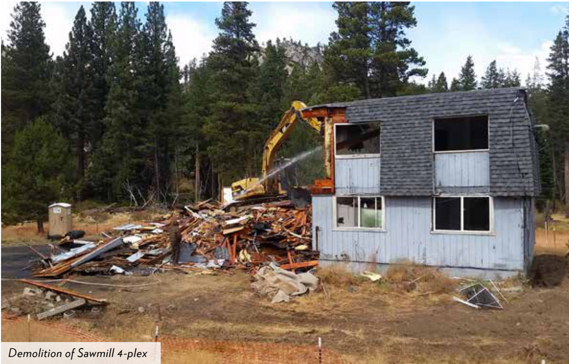
Demolition of Sawmill 4-plex

SECURED acquisition funding in partnership with the Tahoe Resource Conservation District to acquire Johnson Meadow, the largest privately-held stretch of the Upper Truckee River connecting over 1,000 acres of floodplain.